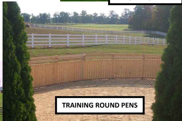
TRAINING ROUND PENS