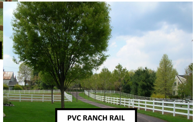
PVC RANCH RAIL