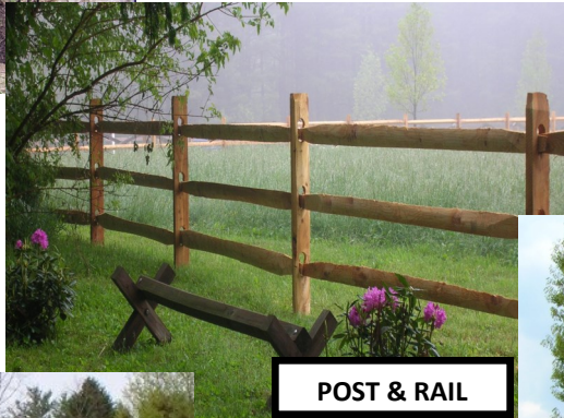
POST & RAIL