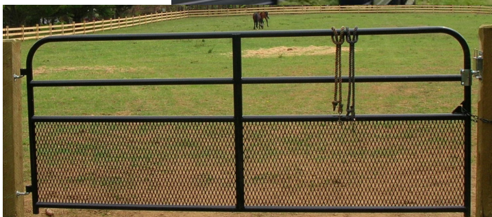
BLACK POWDER COATED HEAVY DUTY GATES (OPTIONAL COLORS)