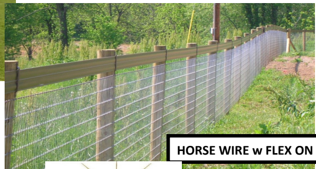
HORSE WIRE w FLEX ON TOP